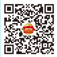
【企业公众号:敬业钢铁】

地址/ Address: 河北省平山县南甸镇 Nandian Town,Pingshan County,Hebei Province. 电话/Tel:0311-966666/82888999 网站/Website: http://www.hbjyjt.com 邮箱/Mailbx:jingyesteel@hbjyjt.com 版权所有 侵权必究 版次:2024年9月第1版 印次:2024年9月第2次印刷 印刷量:3000册 本公司保留最终解释权和修改权